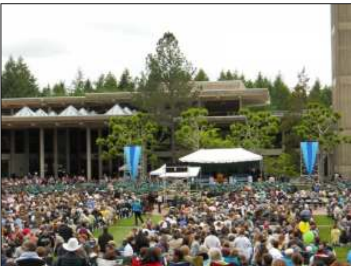
Sarah in the procession before graduation!