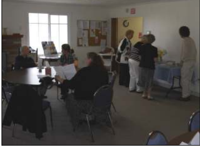
The faithful worshipers at St. Mark's!