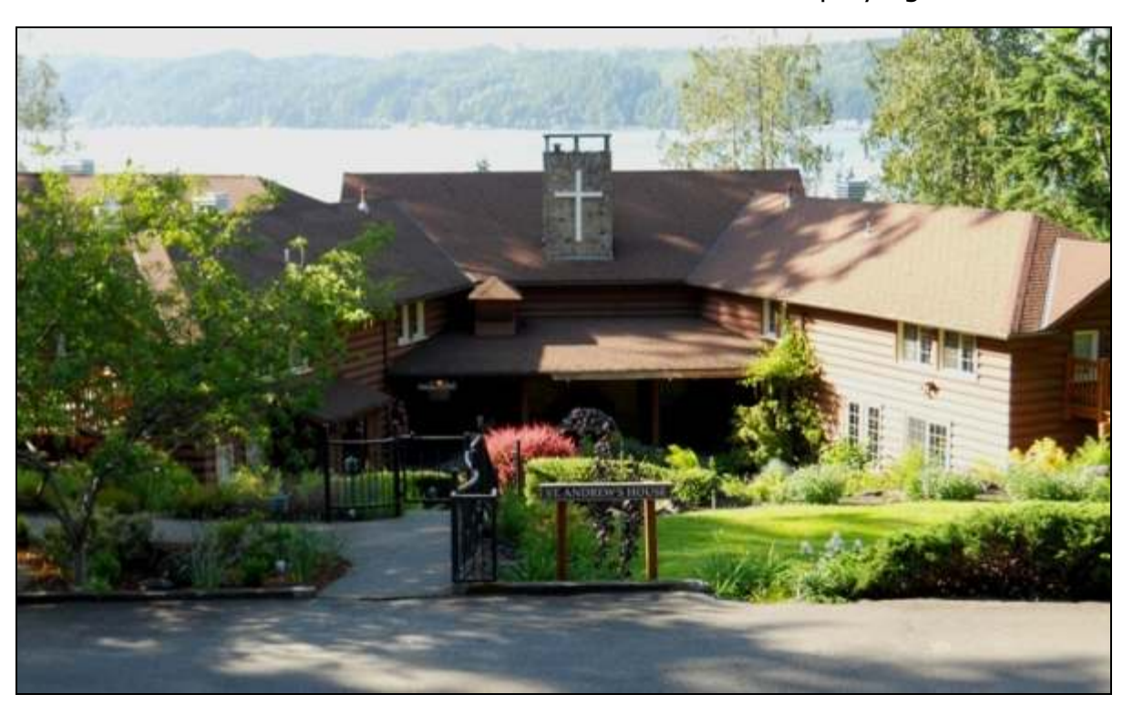
St. Andrew's House--a truly beautiful place on Hood Canal!