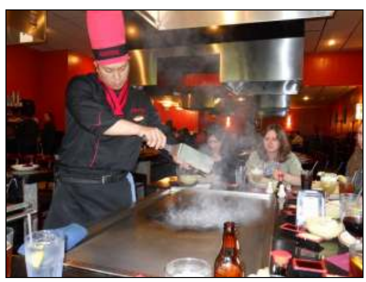
Celebrating at the Japanese restaurant--our chef at work!