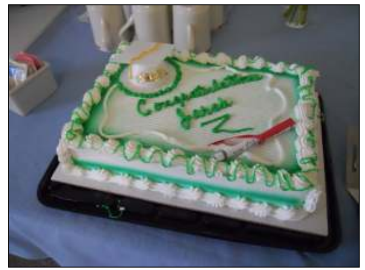
The graduation cake on Sunday at church!