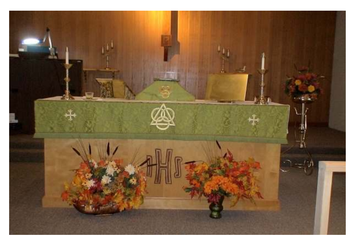
Closeup of the moved altar and flowers in their new location.