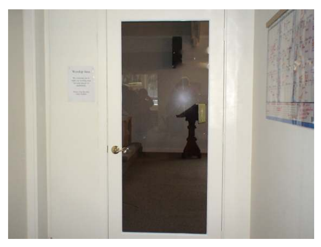
New glass door to worship space from the meeting hall installed; replaces old worn solid wood door.