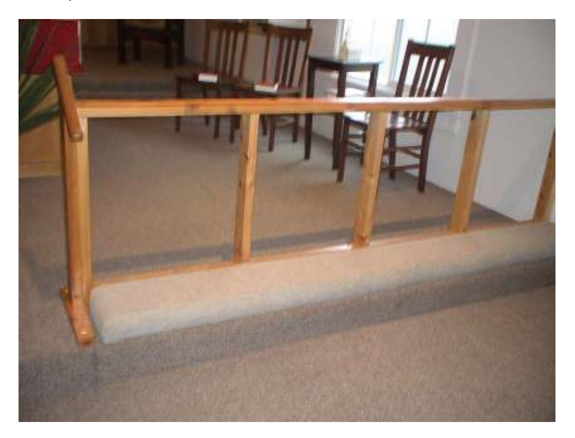
Closeup of a new communion rail and kneeler in its new location.