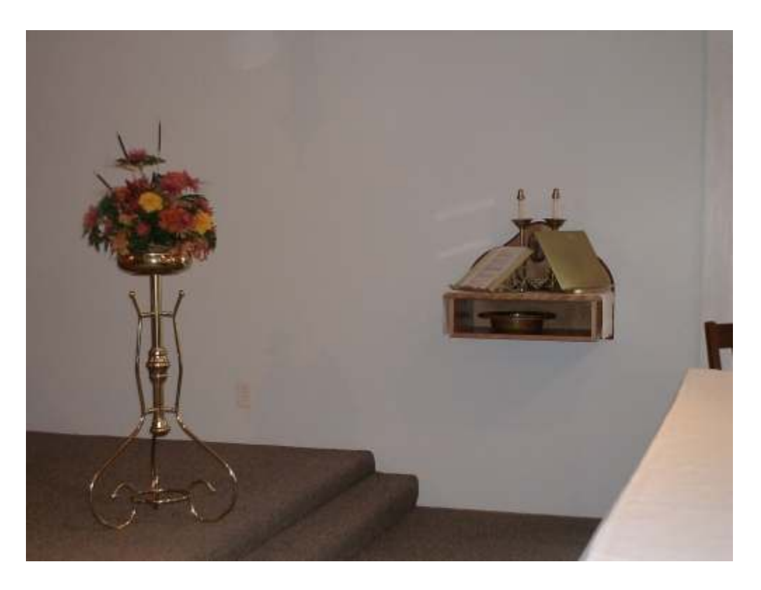
Closeup of the plant stand and credence table in their new locations.